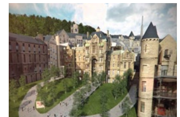
Royal Victoria Hospital Odors and IAQ

Dynamics Air Quality Solutions PO Box 1258, Princeton, NJ 08542 800.578.7873 www.DynamicAQS.com