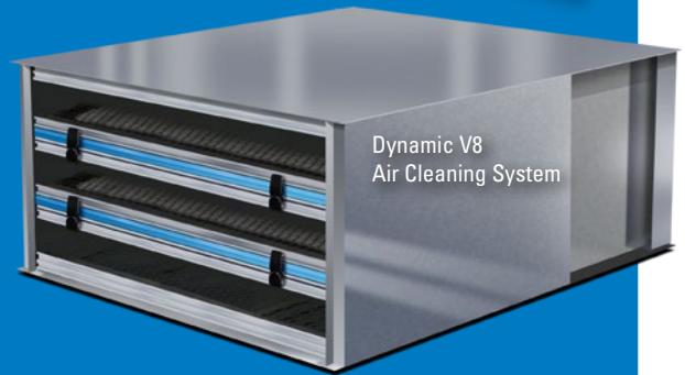
Dynamic V8 Air Cleaning System