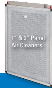
1" & 2" Panel Air Cleaners