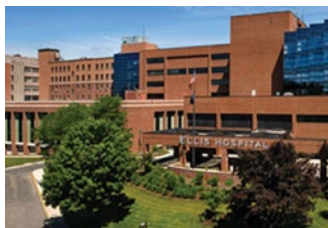
Ellis Hospital Odors, IAQ and Reduced Maintenance

relevant case studies that address a variety of challenges related to air quality, sustainability and maintenance, along with the solutions that provided proven results. These include: