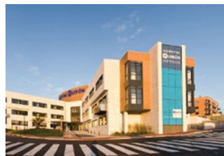
Hospital Viamed Reducing Energy and IAQ