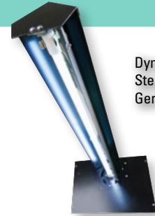
Dynamic Sterile Sweep® Germicidal UVC System